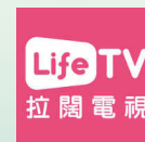
LifeTV Hong Kong